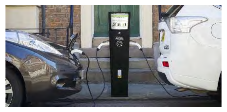
An example of on street charge point

maintain all our street lights under a 25yr PFI (Private Finance Initiative), this passes all the risk of the street lighting to Tay Valley Lighting. There are some complex and costly legal issues about providing another party access to the lights. Although these might potentially be overcome it will take significant time and resources to do so, and there is no guarantee they can be resolved. We have ambitious aims for EV in the County, and need to be taking early action.