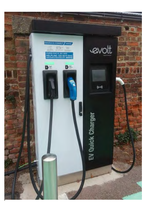
An example of a Rapid Charge Point