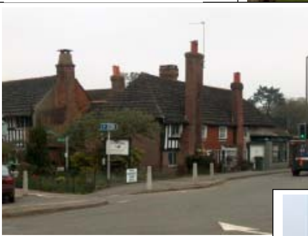
St Peter's Cottage, circa 16 th century was once one property, but has been divided into three properties now, one housing a restaurant.