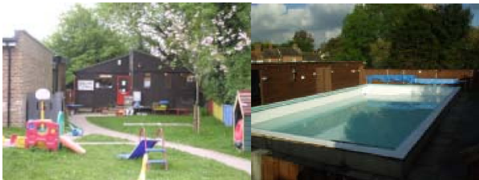
Pictures of St Peter's CE (Aided) Primary School and Country Mice Pre-School.