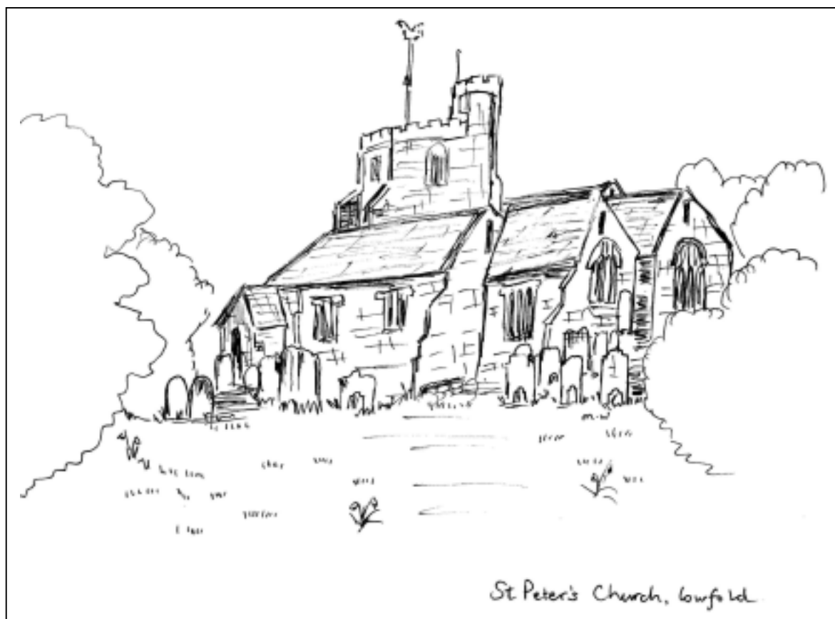
Cover of the Cowfold Parish Questionnaire

The Steering Group kick-started the process after receiving the questionnaire results by inviting all those respondents who said they would like to be more involved to attend the next Steering Group meeting. The enlarged Steering Group worked on the action plans, resulting in this document. This Parish Plan was endorsed by Cowfold Parish Council on 10 April 2006.