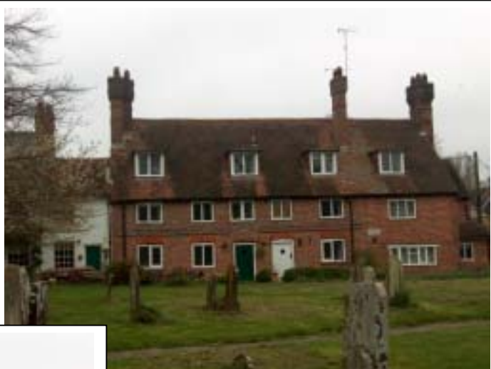
Margaret Cottages on Church Path, circa 17 th century.

The oldest part of the present church is the chancel, which is mostly C13 th and has been dated to the time of Edward I (1272 – 1307).